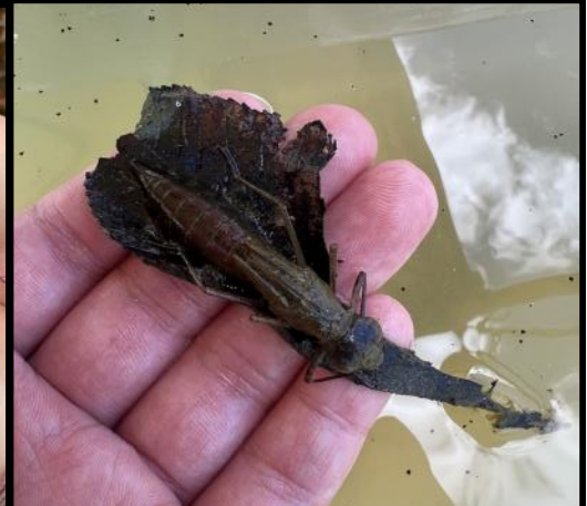
Large dragonfly nymph caught at Chieftain Elementary School.