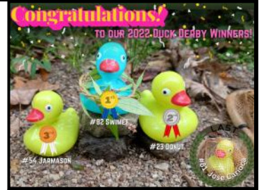
Duck Derby Winners!

Watch out on Facebook and Instagram for updates on the RCP Duck Derby for 2023!