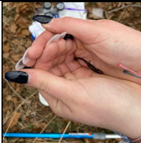
Salamander found using the My Backyard Stream kit.