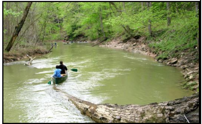
Canoeing on Raccoon Creek

Project success and water quality improvements are determined by conducting chemical and biological monitoring throughout the basin. Regular and consistent monitoring is necessary to determine project effectiveness, maintenance needs, and long-term water quality trends over time. Chemical and biological monitoring conducted by a variety of partners over the past 40 years has shown consistent improvement since watershed remediation efforts began in the 1980s. In recent years, we have had the honor of sharing with you the exciting news of the recovery of Raccoon Creek as chemical water quality parameters have improved and biological communities have rebounded. Currently, Raccoon Creek is home to over 80 species of fish, including the state threatened paddlefish.