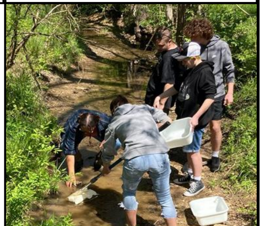
The biology portion of the My Backyard Stream kit in use.