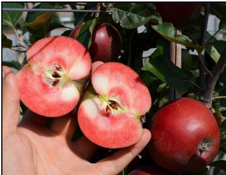
Apples from Hocking Hills Orchard.