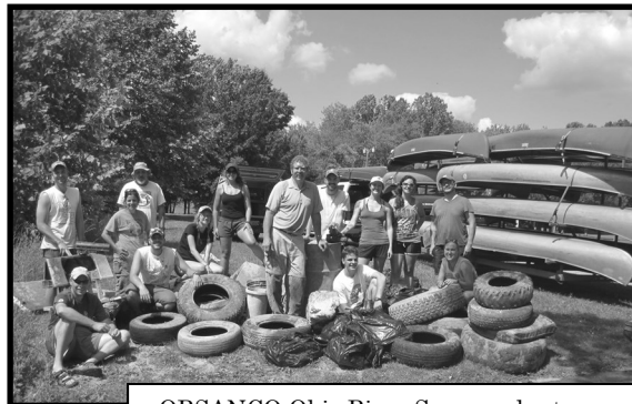
ORSANCO Ohio River Sweep volunteers pictured with waste collected from the creek

It has been another great year on the Creek for the Raccoon Creek Water Trail Association! Weather and water cooperated for our spring float on the beautiful upper section of Raccoon Creek from Hope School to Moonville. Later in June we teamed up with ORSANCO's Ohio River Sweep, picking up trash on the section above the Village of Vinton Park. We had a great turnout of students and community members who filled our canoes with tires and trash! We plan to continue our promotion and stewardship of Raccoon Creek with a fall float, scheduled for October 5th. Our floats are open to the public and we provide the use of our canoes, free of charge. In addition to our canoes, we recently added two new kayaks to our fleet; thanks to a generous donation from the Ora E. Anderson Conservation Fund.